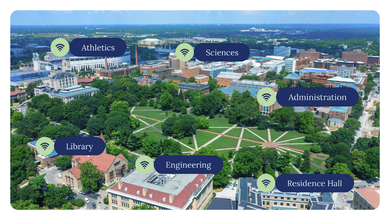
Potential high-level network segmentation zones

Higher education is predominant in the usage of IoT devices, utilizing them for infrastructure management and for improving the overall student and faculty experience within the premises. Collecting data from connected devices for personalized learning experiences, implementing energy-efficient utility systems, securing the campus networks through smart cameras—the benefits offered by IoT devices make them indispensable to educational institutes.