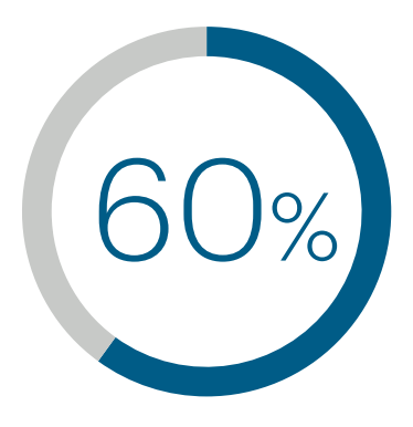
of enterprises will have a SASE strategy by 2025