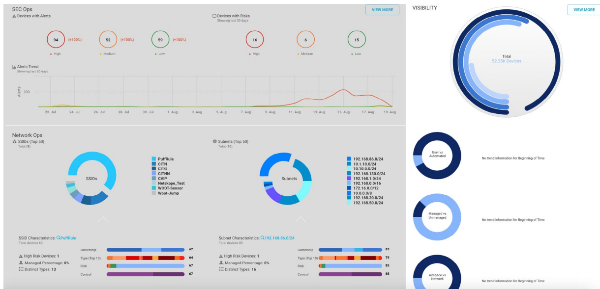
Netskope Device Intelligence Executive Dashboard

Medical institutes host multiple connected surgical and monitoring devices used for remote patient monitoring, heart rate monitoring, robotic surgery and radiotherapy, along with a wide set of managed IT equipment ranging from IP cameras, access points and audio-video conferencing systems, to unmanaged staff and patient devices, such as smartphones and wearables. Developing rich context around these devices has become of critical importance to ensure security and enforce the right network access controls. Current device fingerprinting technologies boil down to device type, category, OS, version, etc. which are woefully inadequate when it comes to making timely, informed security decisions. To keep networks secure you need to have a deeper understanding of devices entering and exiting the hospital networks, and map their dynamic behavior with associated risks to take necessary actions. This calls for developing rich and dynamic device context across multiple dimensions and combining them with machine learning algorithms to generate models and signatures for each device, allowing granular visibility and control.