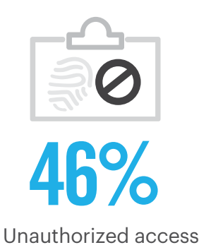
Figure 1. | What do you see as the biggest security threats in public clouds? Infographic from Cybersecurity Insiders Cloud Security Report 2019 [3]

Misconfigurations that lead to exposure of sensitive data