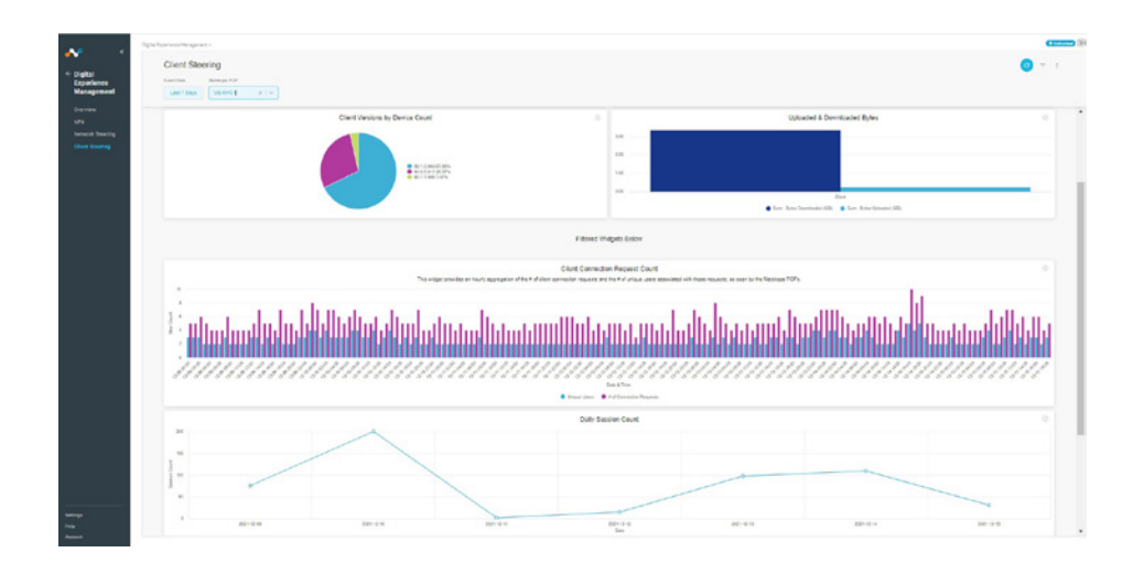
Figure 2: The Client Steering dashboard is just one of many administrator views provided as part of Netskope Digital Experience Management.

To complement Netskope Client, Netskope Proactive Digital Experience Management (P-DEM)—part of the Netskope Admin UI enabled on a per-customer tenant basis—gives administrators rich visibility and control over client steering traffic. This includes actionable insights on active user counts, licensed seat counts, Netskope Client versions being used, uploaded and downloaded bytes, plus filtered views with additional granularity on log-in attempts, usage trends, plus daily session counts.