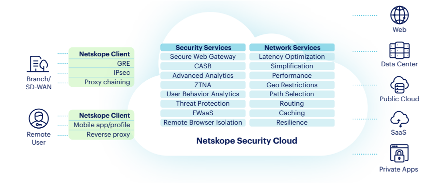
Figure 1: In addition to support for legacy proxies, firewalls, SD-WAN devices, and clientless options, Netskope Client simplifies steering traffic to Netskope NewEdge.