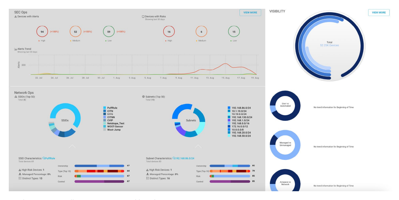
Netskope Device Intelligence Executive Dashboard

Medical institutes host multiple connected surgical and monitoring devices used for remote patient monitoring, heart rate monitoring, robotic surgery and radiotherapy, along with a wide set of managed IT equipment ranging from IP cameras, access points and audio-video conferencing systems, to unmanaged staff and patient devices, such as smartphones and wearables. Developing rich context around these devices has become of critical importance to ensure security and enforce the right network access controls. Current device fingerprinting technologies boil down to device type, category, OS, version, etc. which are woefully inadequate when it comes to making timely, informed security decisions. To keep networks secure you need to have a deeper understanding of devices entering and exiting the hospital networks, and map their dynamic behavior with associated risks to take necessary actions. This calls for developing rich and dynamic device context across multiple dimensions and combining them with machine learning algorithms to generate models and signatures for each device, allowing granular visibility and control.