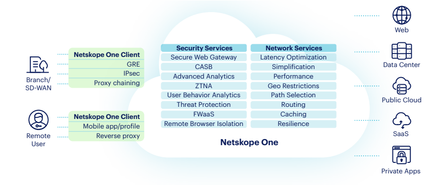
Figure 1: In addition to support for legacy proxies, firewalls, SD-WAN devices, and clientless options, Netskope One Client simplifies steering traffic to Netskope NewEdge.